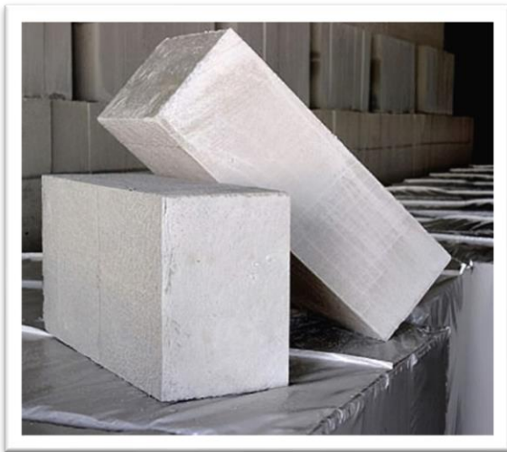
Figure 1: 12x8x24 AAC Block

Autoclaved Aerated Concrete, more commonly referred to as AAC, is a closed-cell masonry product that comes in blocks or panels. This "aerated" product was first developed in Germany in the 1880s, then perfected and patented in the 1920s by a Swedish architect named Johan Axel Eriksson. Sweden and much of Europe were experiencing lumber shortages because of World War I, so an alternative construction method needed to be developed. Dr. Eriksson discovered that by curing the material with heat and pressure in an autoclave, the final product was much more substantial and dimensionally accurate than when it was "air cured."