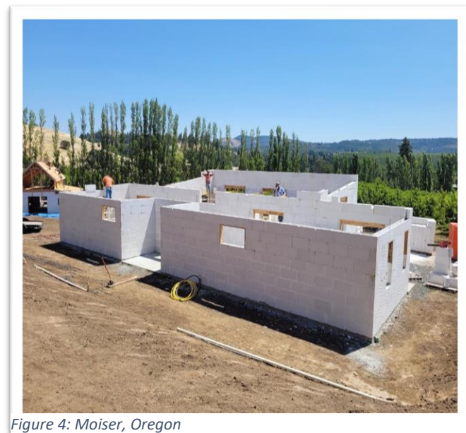
Figure 4: Moiser, Oregon

Unlike most building materials used today, AAC is 100% inorganic. In climates where termites and other insects flourish, AAC is a perfect application, as pests cannot eat it. Its solid construction also alleviates voids where pests can live and colonize. In addition, AAC's inorganic properties leave no nutritional value for molds and fungi to thrive, leaving it the perfect material for use in wet climate areas.