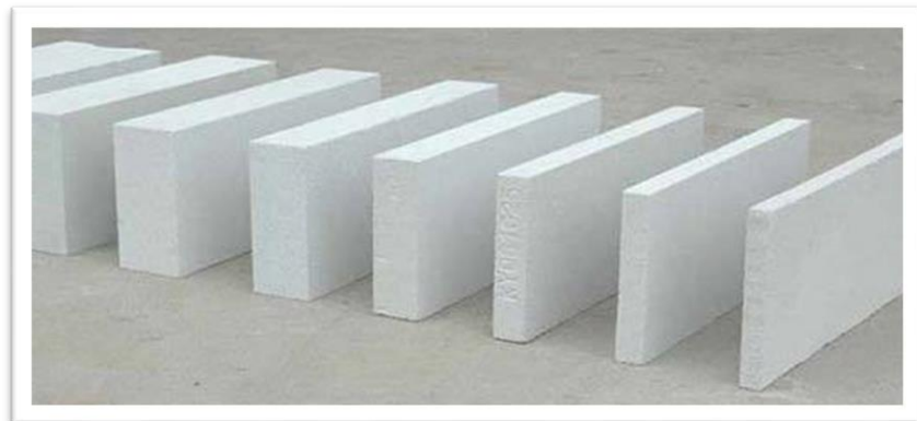
Figure 3: Different-Sized AAC Panels and Blocks