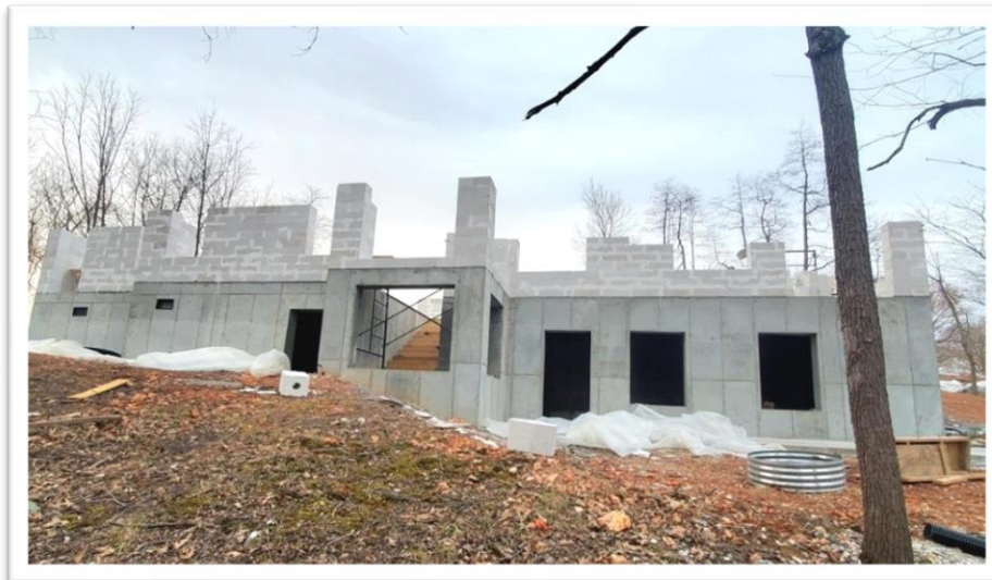
Figure 6: Concrete Foundation with AAC Block, Bentonville Arkansas