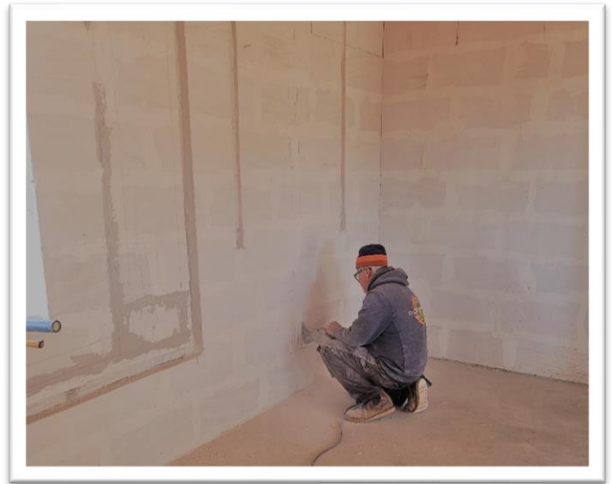
Figure 2: Rough-in Electrical and Plumbing

AAC can be pre-cut or pre-channeled, utilizing half the thickness of wall depth for plumbing and electrical for piping and conduits. The most time-effective method is simply running a router or saw to create the preferred channel. See figure 2.