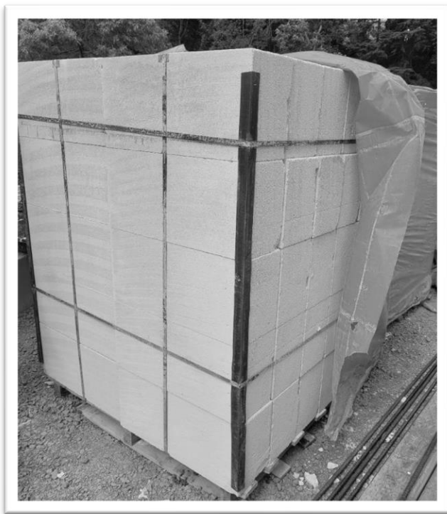
Figure 7: One Pallet Contains 60 Blocks of 12x8x24.

Historically, AAC has been considered a premium-cost product only used for expensive custom homes. AAC is very competitive today with most other construction methods, including residential wood construction. Because AAC eliminates many steps in the building process, the cost comparison to other construction methods is a bit complicated sometimes. The houses we are currently building in Oregon and California are selling for the same price as wood-built homes of a similar design.